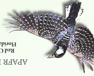
APAFR Endangered Species Red Cockaded Woodpecker Florida Grasshopper Sparrow

Other programs that contribute to the economies of Highlands and Polk County include outdoor recreation, cattle grazing, forest management and timber sales. The Range's environmental stewardship program protects the unique plant and animal habitats and cooperates with The Nature Conservancy and Archbold Biological Station to study and protect the rare plants and endangered species inhabiting the Range.